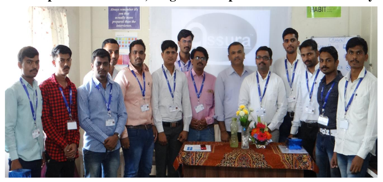
11. Organized National seminar on "Green approaches in organic synthesis" held on 26^{\rm th} - 27^{\rm th} Dec. 2018

10. Our department 08 M.Sc chemistry students completed training in Assura pharma institute ,Sangli and all placed in various industry.