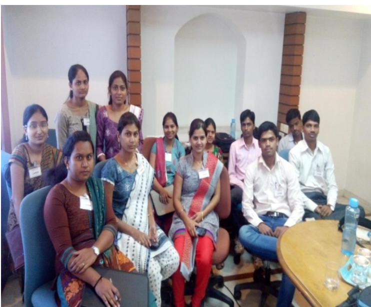
4. Organized State level Seminar of Chemistry on "Advances in Drug discovery and drug designing" at SCSM College in Dec.2016.