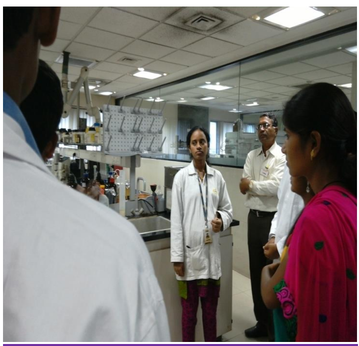
2. One day workshop on "Career opportunities in pharma industry" on Dec.2014