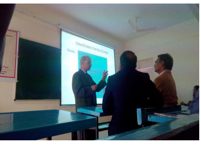
5. Organized "National level conference on Spectroscopy" at college. On 24<sup>th</sup> -25<sup>th</sup> Dec.2016